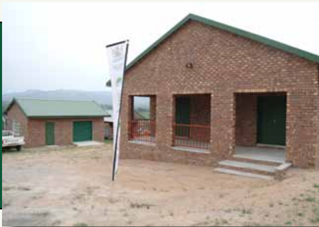
The new office structure and storeroom for the Nhlangu West sugarcane project in Nkomazi