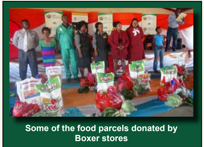
Some of the food parcels donated by Boxer stores